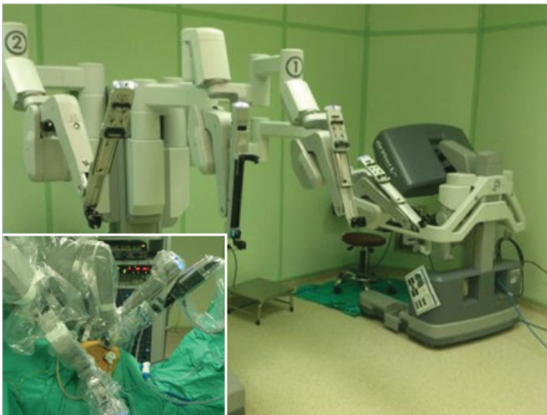
Figure 1. Robotic system operating table and tower

All operations were done by the same surgeon, using daVinci® SI robotic surgical system (Intuitive Surgical™, Mountain View, CA, USA).